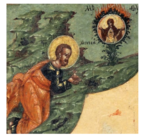
Figure 9. Moses and the Burning Bush. Detail from R2012.81