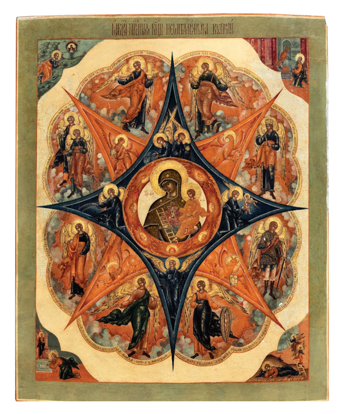
Figure 1. Theotokos of the Unburnt Bush, Icon #2012.81