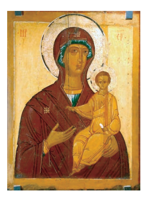
Figure 7. Smolensk Mother of God, 15<sup>th</sup> century, from Kinerma in the Pryazha region of the Russian Republic of Karelya.<sup>8</sup>