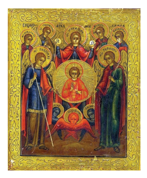
Figure 8. The seven archangels (upper third of the icon) ^{19}\,

all three of whom are named directly in sacred scripture. In the Orthodox tradition, there are four other archangels, whose names are known only from tradition and noncanonical sources<sup>17</sup> (i.e., the apocryphal Book of Enoch<sup>18</sup>):