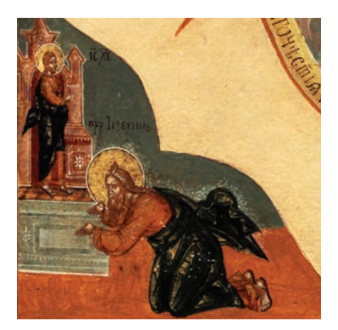
Figure 11. Vision of the Prophet Ezekiel. Detail from R2012.81