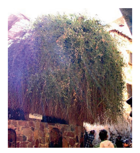
Figure 3. The bush, a type of bramble ( rubus sanctus ) traditionally believed to be where God appeared to Moses in the form of fire, is located at Saint Catherine's Monastery in Egypt.<sup>3</sup>