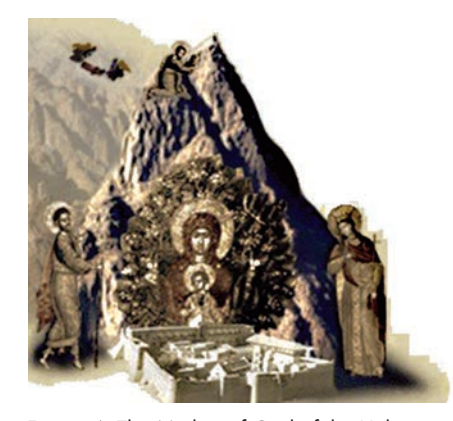
Figure 4. The Mother of God of the Unburnt Bush icon type is thought to have originated at the Monastery of Saint Catherine where a prototype is depicted on a rock.<sup>6</sup>

here that legend places the origin of the holy icon, where its image is supposed to have been depicted on the rock adjacent to the bush where God revealed himself to Moses.<sup>3</sup>