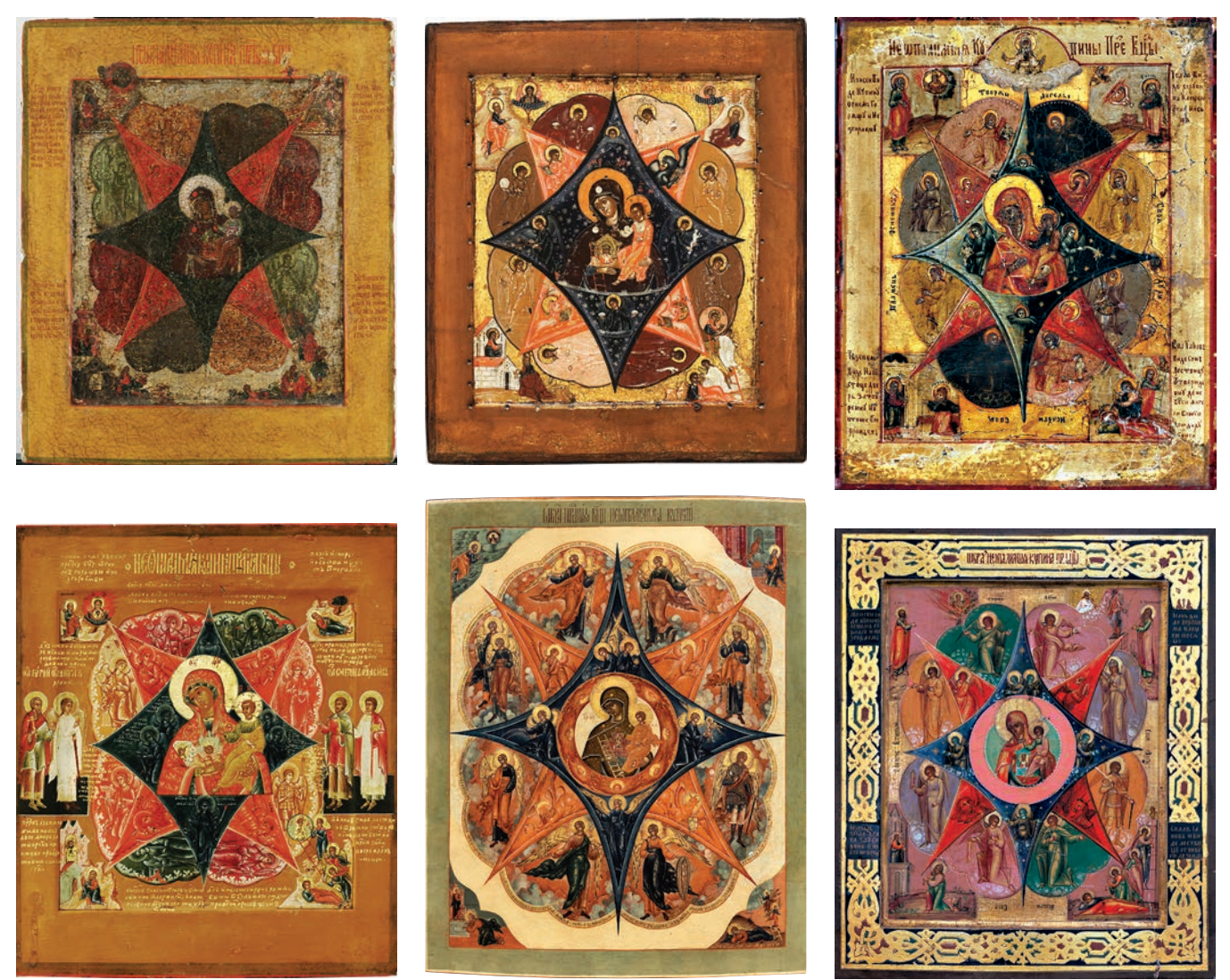
Figure 5. Selected icons from the Museum's collection, illustrating similarities, differences, and increasing artistic refinement over time. (top row, left to right): R2000.8, ca.1700; R2010.39, ca.1750; R2006.23, ca.1825. (bottom row left to right): R2007.28, ca.1870; R2012.81, ca.1880; R2000.14, ca. 1890.

The version of the icon that we will focus on here) was created in the 19<sup>th</sup> century (Figure 1 and Figure 5, bottom row, middle). The icon is stunningly beautiful, executed in a striking blend of colors that are both complementary and subtle. Unlike most icons of the Theotokos, where the Mother of God and the Son of God are the only figures, in the Mother of God Unburnt Bush virtually every part of the icon is filled with additional figures, of angels and archangels, evangelists, and Old Testament Patriarchs—in our version, amounting to 21 full figures! Nevertheless, there is no sense of crowding or congestion, because its symmetry and the relation of the figures to one another give it an elegance and harmony that engender in the viewer an air of peace and deep prayerfulness.