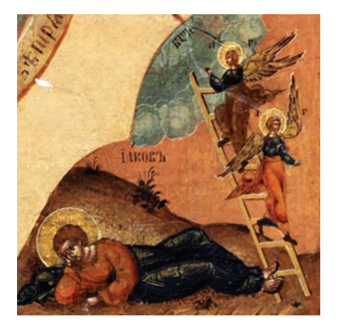
Figure 12. Jacob's Dream. Detail from R2012.81

Here again, the early church fathers interpreted this as a prefiguration of the role of the Mother of God in the economy of salvation, with the Theotokos, because of her unique position as the Mother of God, serving as the bridge, or ladder by which Jesus descended to the earth, and by which people are able to ascend to heaven. It is also why she is shown holding a ladder in the central portion of the icon.