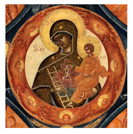
Figure 6. Center detail of Theotokos of the Unburnt Bush, Icon #2012.81