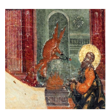
Figure 10. Isaiah's Vision of the Lord. Detail from R2012.81

The early church fathers believed that the burning bush was not a physical phenomenon in which the bush, though on fire, was somehow miraculously protected from the destructive effects of the flame, but rather that what Moses saw as fire was the uncreated energy of God (who, according to Saint John, is light), and that God used the bush as a vehicle or channel through which to reveal himself to Moses, much as he used the evangelists as channels for the light of his truth to pour into the world. They saw in this a prefiguring of the incarnation of Christ, according to which God's presence (Jesus) came into the world through his birth from Mary (John 1:9 — "The true light that gives light to everyone was coming into the world"), who nevertheless remained perpetually virgin, her virginity not being "consumed" by it. True to this understanding, our icon places the image of the Mother of God of the Sign in the bush in place of the fire.